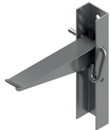
Cable Bearer, Locking Pin & Wall Bracket